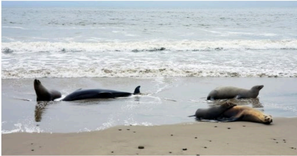
Deceased dolphin and stranded California sea lions showing clinical signs of domoic acid toxicosis.