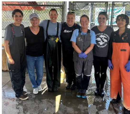
SR3 team at Marine Mammal Care Center LA